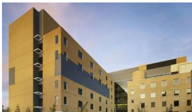
The Robbins Pavilion